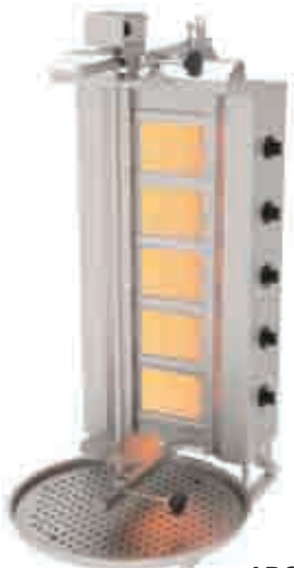
ADG - 5 U