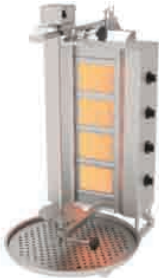
ADG - 4 U