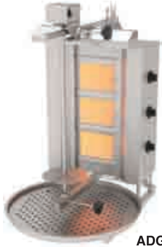
ADG - 3 U