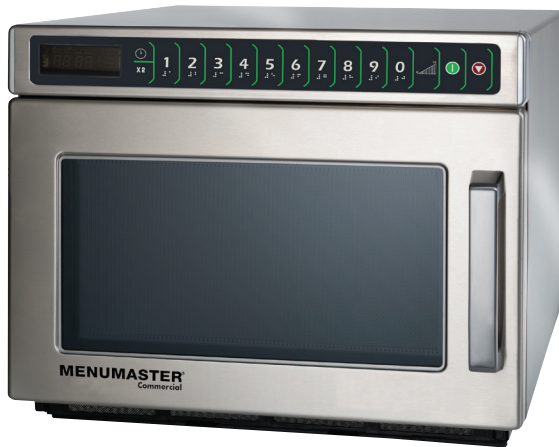
Model MDC182 shown