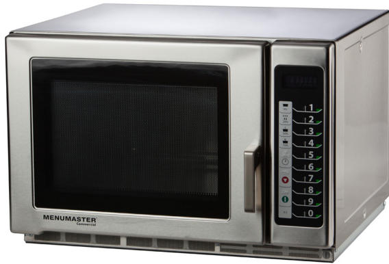
Model MFS18TSSA shown