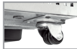
1 1/2" diameter dual swivel castors for "LP" models.