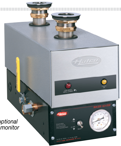
3CS-9 with optional temperature monitor