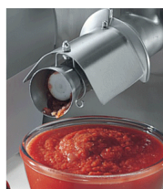
Optional tomate sauce making