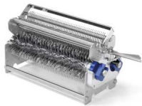
Tenderizing blade assembly with 96 blades