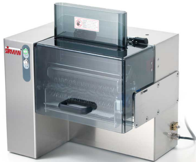
Sirman Tenderizer , model Drake :

Sirman Spa Viale dell'Industria 9/11 35010 PIEVE DI CURTAROLO (PD), Italy Tel./Fax. +39 049 9698666 / +39 049 9698688 email: info@sirman.com