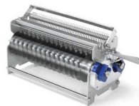
Cutting blade assembly